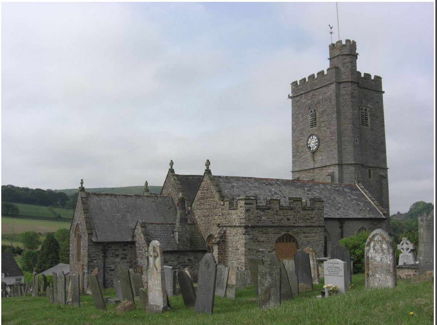
St. Paul's Churchyard, Landkey

St. Paul's Churchyard, Landkey, Devon contains 2 Commonwealth War Graves – one from World War 1 & one from World War 2.