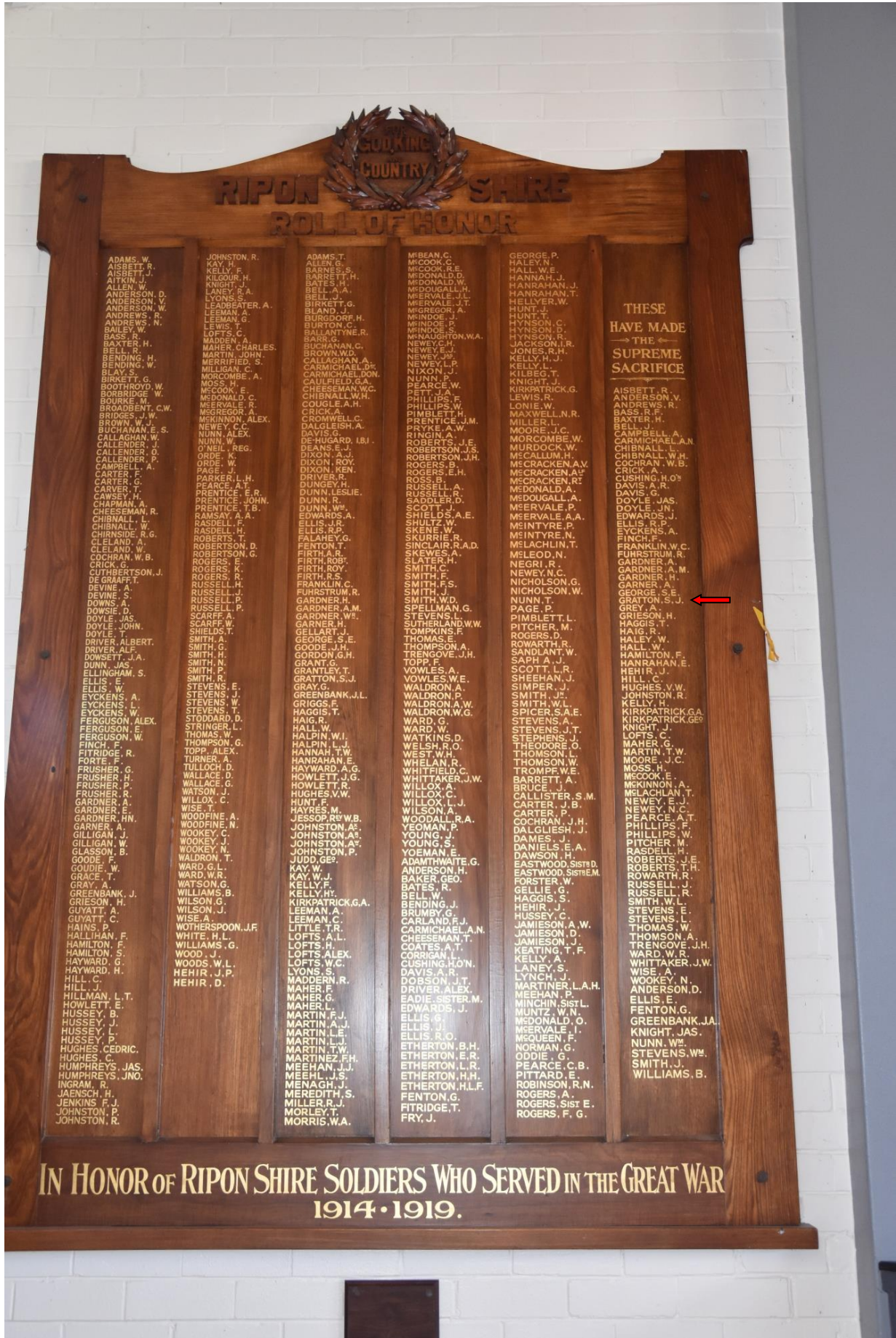
Ripon Shire Roll of Honour