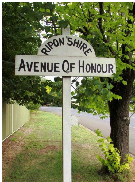
Ripon Shire Avenue of Honour