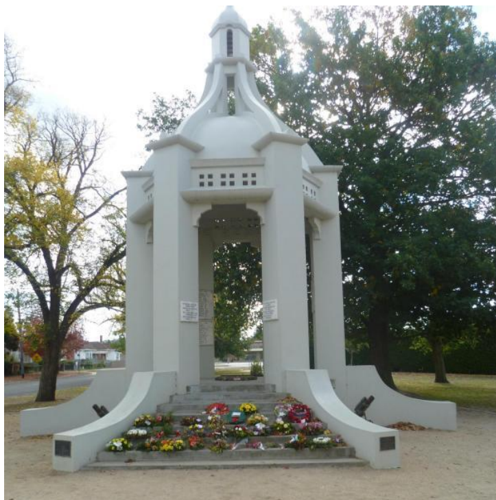
Beaufort War Memorial