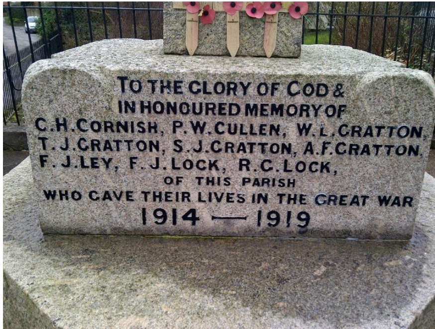
Landkey War Memorial